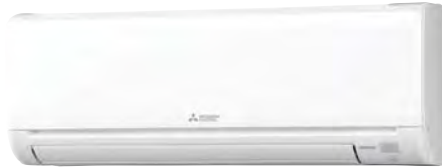
Indoor Unit: MSZ-GL06NA-U1