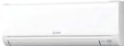
Indoor Unit: MSZ-GL09NA-U1