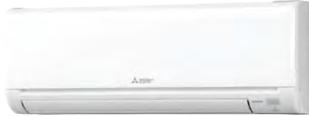
Indoor Unit: MSZ-GL12NA-U1