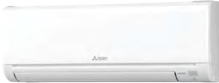
Indoor Unit: MSZ-GL15NA-U1