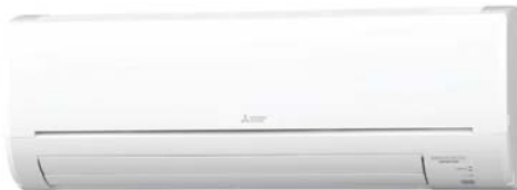
Indoor Unit: MSZ-GL24NA-U1