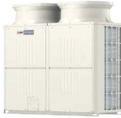
OUTDOOR VRF HEAT PUMP SYSTEM