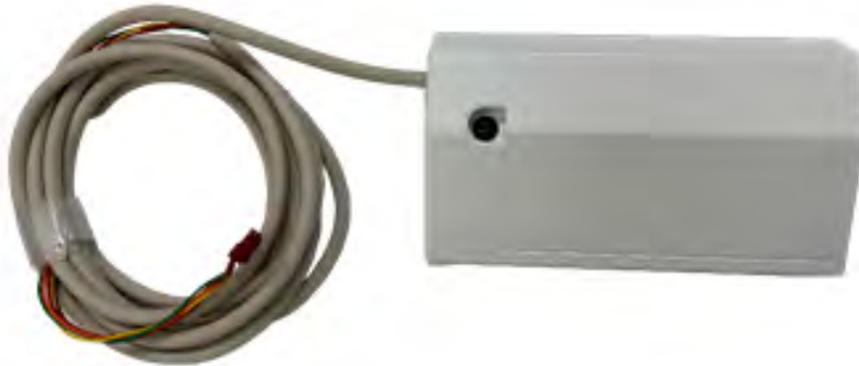
MAC-497IF-E Two wire MA Controller Interface